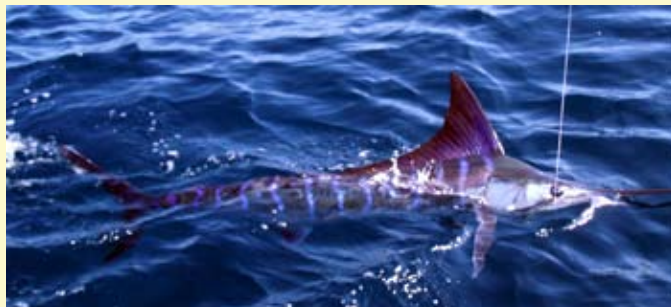
Joe's striped marlin ready for release