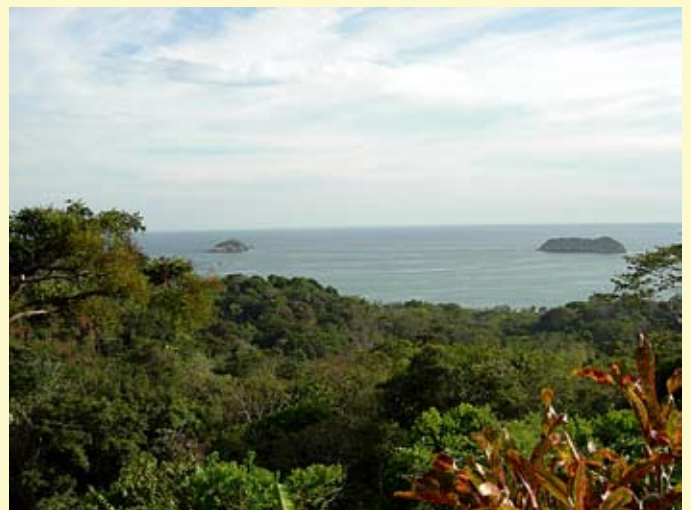
Overlooking Manuel Antonio National Park from the La Mariposa Hotel

Let's retrace the steps of what makes Quepos Costa Rica a world class fishing destination!